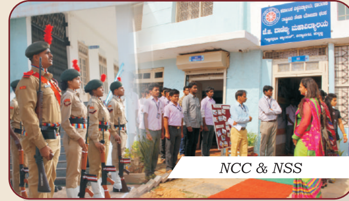
NCC & NSS