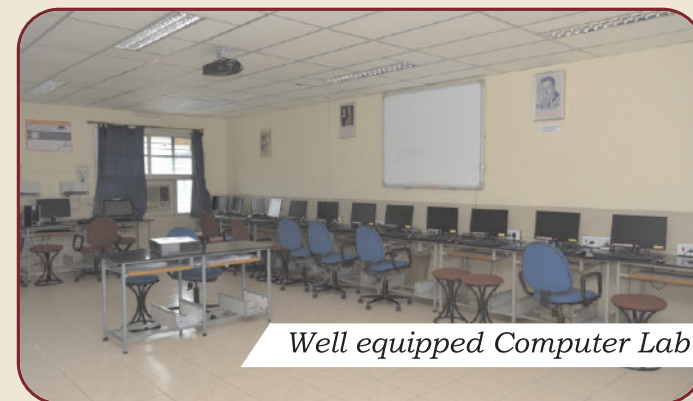
Well equipped Computer Lab