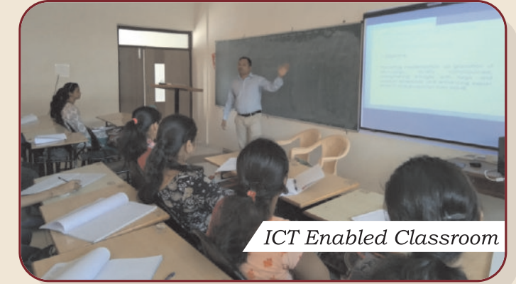
ICT Enabled Classroom