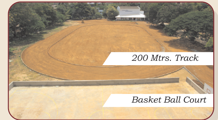
200 Mtrs. Track